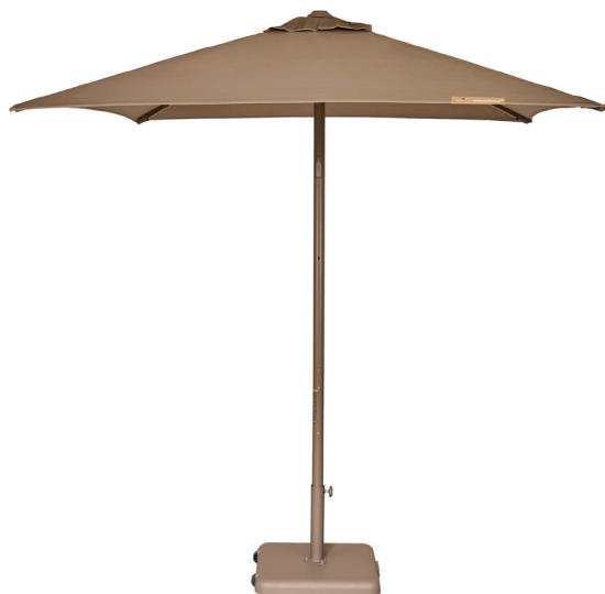
Taupe Frame + Taupe Canopy Base not included, shown with taupe Bond base. Square Canopy Available in 10' x 10' | 8' x 8' | 7' x 7'