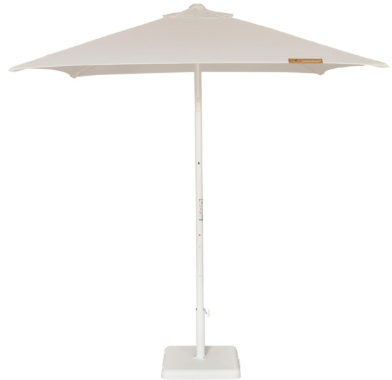
White Frame + White Canopy Base not included, shown with white Bond base. Square Canopy Available in 10' x 10' | 8' x 8' | 7' x 7'