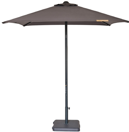
Anthracite Frame + Anthracite Canopy Base not included, shown with anthracite Bond base. Square Canopy Available in 10' x 10' | 8' x 8' | 7' x 7'

Lacquered Aluminum with Pureti Treated Olefin Fabric