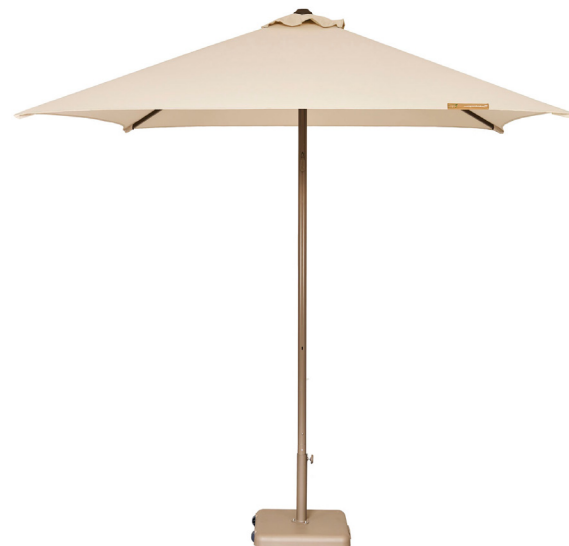
Taupe Frame + Sand Canopy Base not included, shown with taupe Bond base. Square Canopy Available in 10' x 10' | 8' x 8' | 7' x 7'